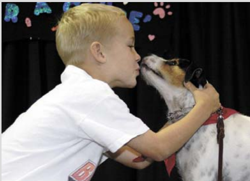
Best Kisser 2 nd year in a row!

"Paws for a Cause" Sponsored by the Rotary Club of Maumelle- $6000 raised for an International Project that will help children in orphanages in Romania.