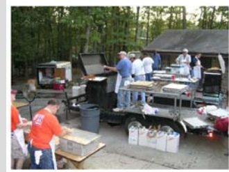
Rotarians hard at work frying fish

"Paws for a Cause" Sponsored by the Rotary Club of Maumelle- $6000 raised for an International Project that will help children in orphanages in Romania.