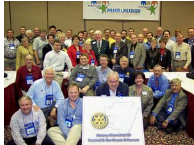
District 6150 Leaders for 07-08