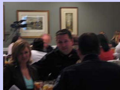
Firemen and Policemen enjoying fellowship and food