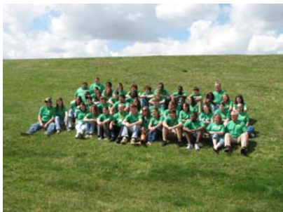
38 RYLEA Campers at Ferndale